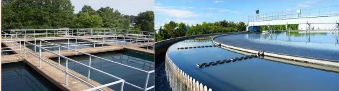
Water Treatment- Industrial and Municipal Applications for Drinking Purpose

Industry Sectors: Steel and Power Sector Industries; Chemical process industries, Refineries and Petrochemicals Food and Beverages; Dairies; Textile and Dyeing , Distilleries; Pulp and Paper;; Metals and Mineral Processing, Pharmaceuticals etc.