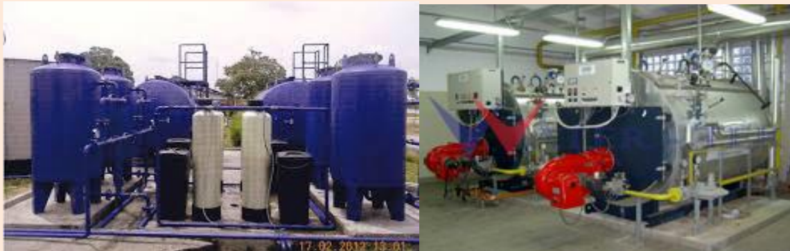
Cooling Water Treatment Fundamentals-Problems, Monitoring and Control Analysis of Raw Water, Boiler Water and Cooling Water

Premier Provider of sustainable solution to Water, Energy and Environment